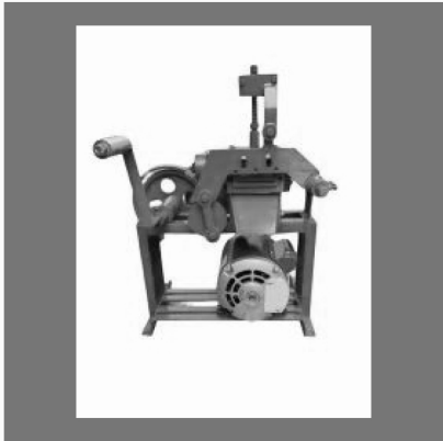
2 in 1 Tobacco Cutting Machine