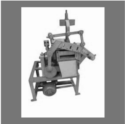
6 inch Automatic Tobacco Cutting Machine