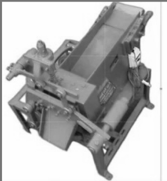
six inch tobacco cutting machine