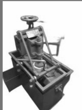
tobacco blade sharpening machine