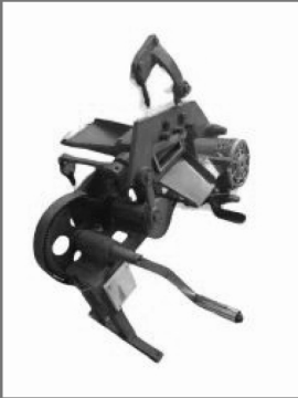
Tobacco Cutting Machine