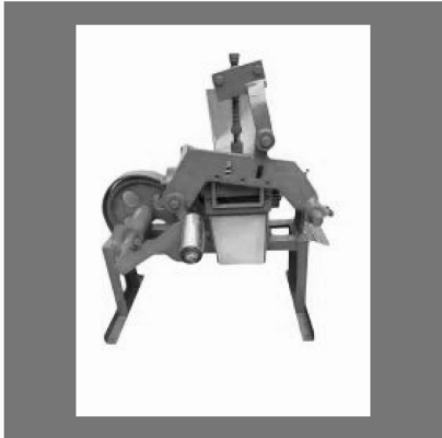
Manual Hand Operated Tobacco Cutting Machine