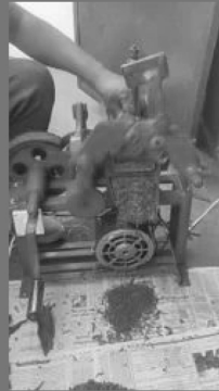
Tobacco Cutting Machine