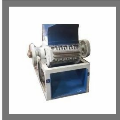
Plastic Dana Cutter Machine