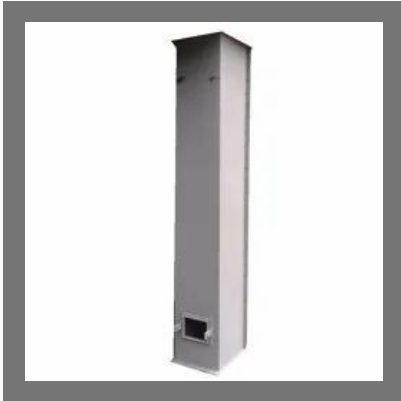
Mild Steel Air Slide