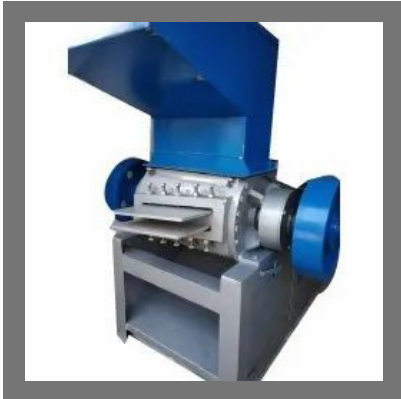
PET Scrap Grinder Machine