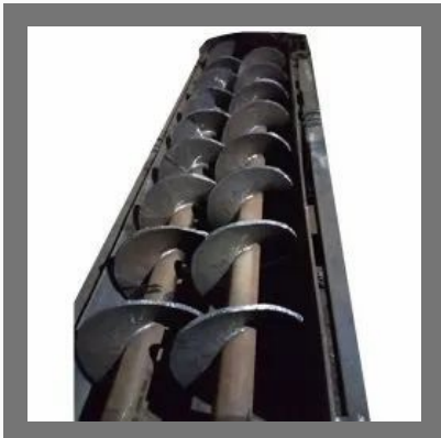
Double Flexible Screw Conveyor