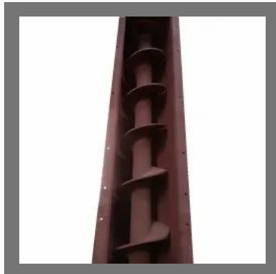
U Trough Screw Conveyor