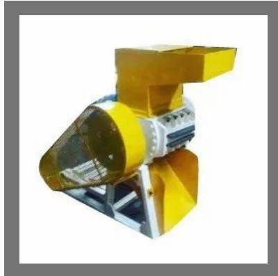
Plastic Scrap Grinder Machine