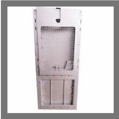
Industrial Automatic Sliding Gates