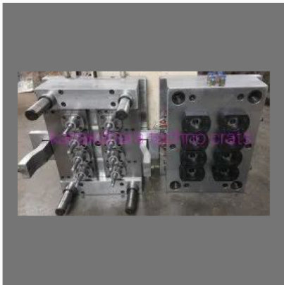
8 Cavity Pet Preform Mould