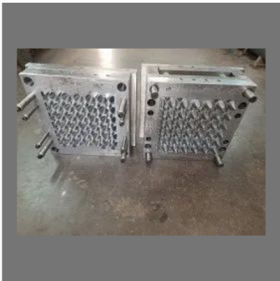
Egg Tray Mould