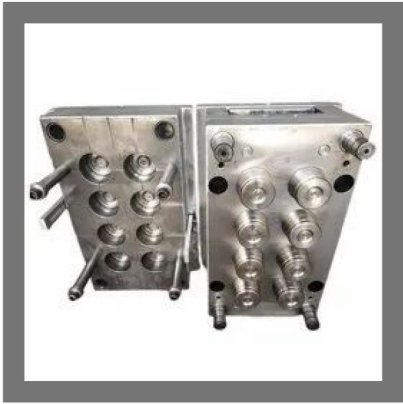
Cold Runner Plastic Bubble Cap Mold