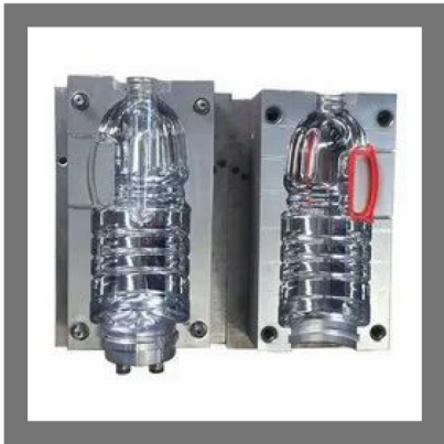
Pet Bottle Mold