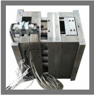
Hot Runner Plastic Bubble Cap Mold