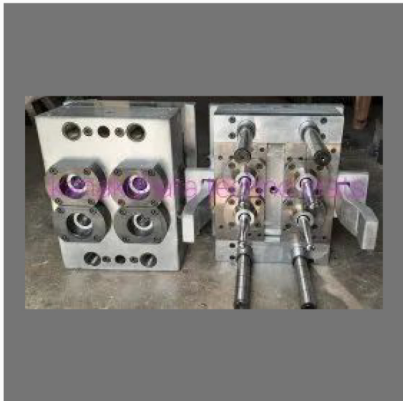
4 Cavity Pet Preform Mould