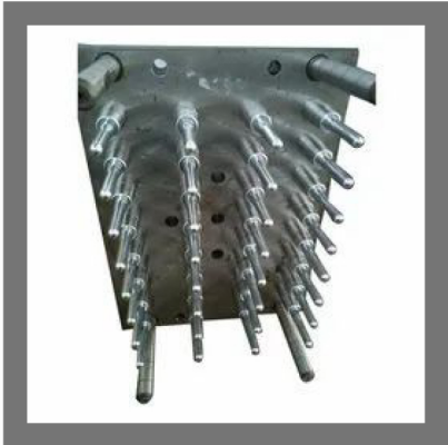
32 Cavity PET Preform Mold