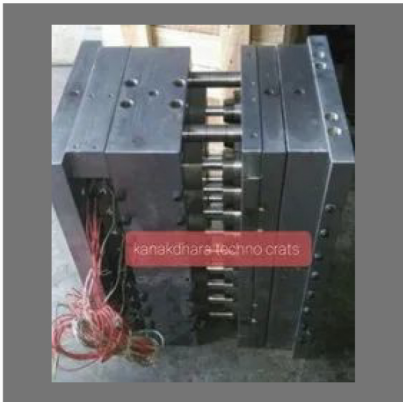
PET Preform Mould