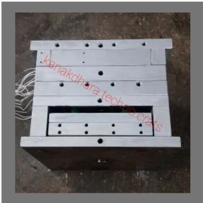
16cavity bubble cap mould in hot plate