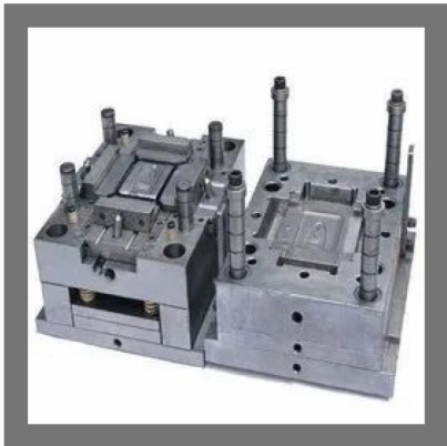
Hot Runner Plastic Injection Mold