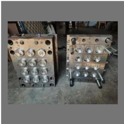
Bubble Cap Mold