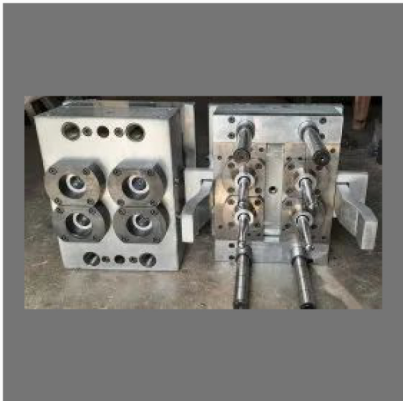
PET Preform Mould