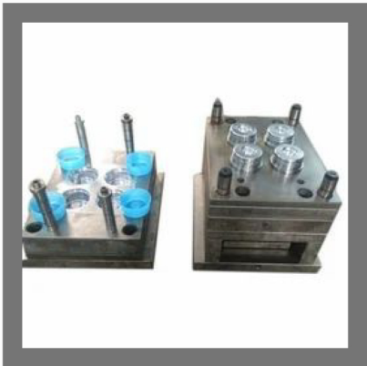
20 Litre Plastic Screw Type Jar Cap Mold