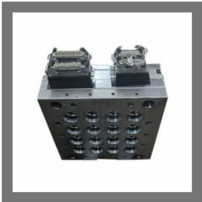
16 Cavity Hot Runner Plastic Bubble Cap Mould