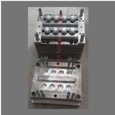
38mm Oil Cap Mould