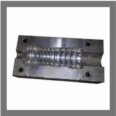
HDPE Water Bottle Blow Mould