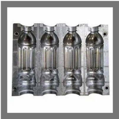
PET Blow Mould