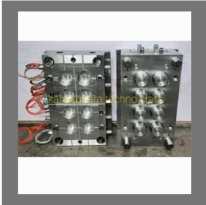
8cavity Bt Cap Mould 15mm Height, Weight 2gms.