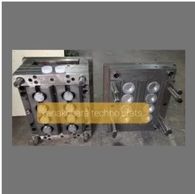
Lubricant Oil Bottle Cap Mold