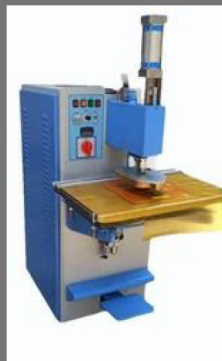
Hf Plastic Welding Machine Neumatic