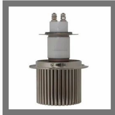
toshiba Triod Electron Tubes