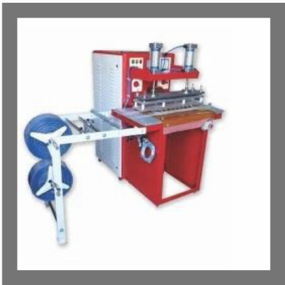
High Frequency PVC Welding Machines