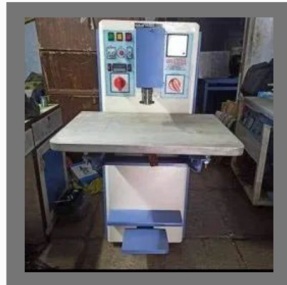
High Frequency Plastic Welding Machine