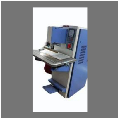
PVC Welding Machine