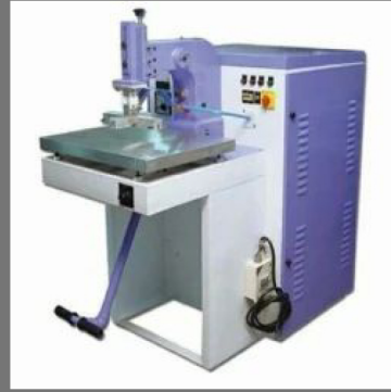
High Frequency Plastic Welding Machines