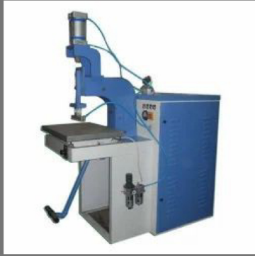
Plastic Welding Machines