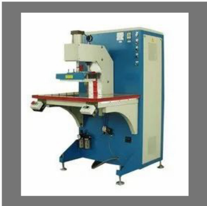
High Frequency plastic Welding Machine