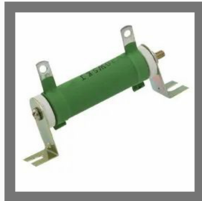
Tube Type Wire Wound Resistors