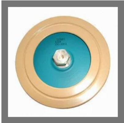
Ceramic Disk Capacitors