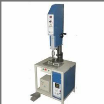
Ultrasonic Plastic Welder