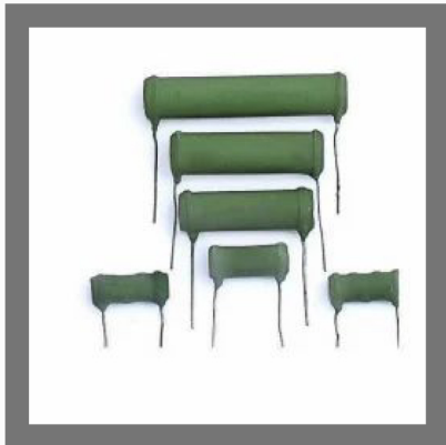
Silicon Coated Wire Wound Resistors