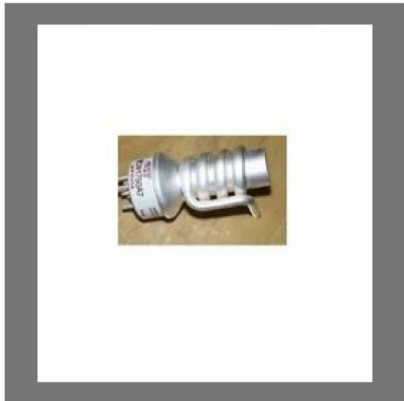
RF Power Triode