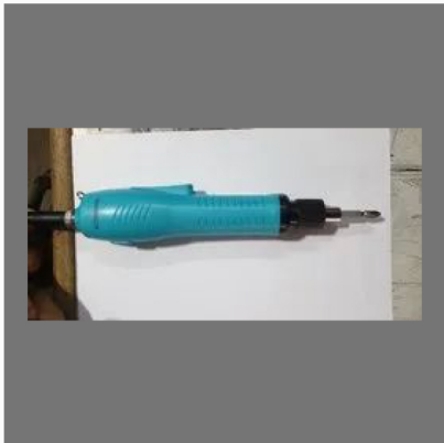
Electrical Screw Drivers