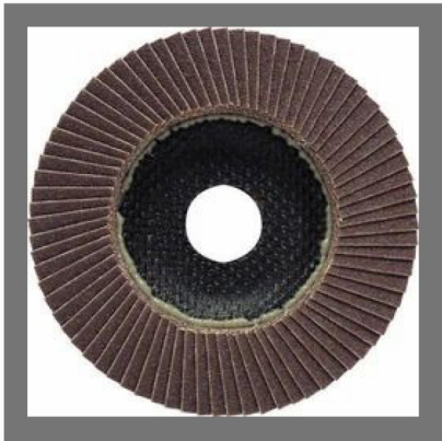
Abrasive Flap Discs