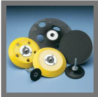
Hookit Backup Pads