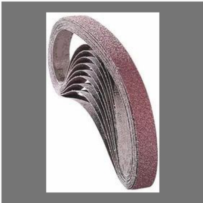
Emery Abrasive Belt