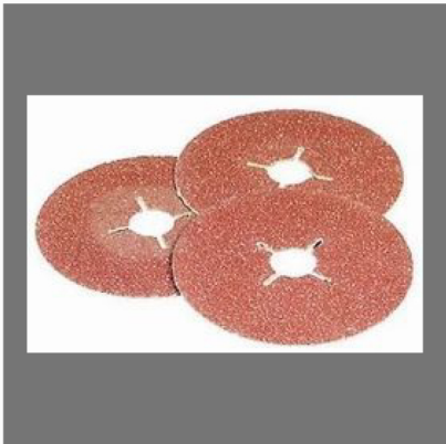
Fiber Abrasive Disc