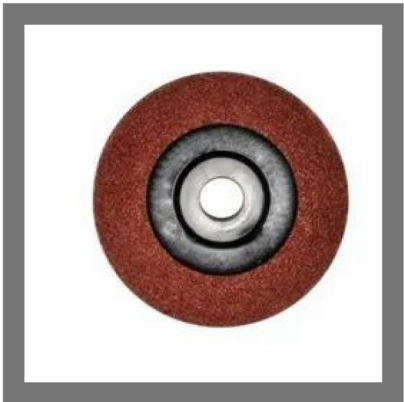
Non Woven Sanding Disc