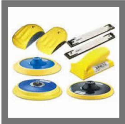
Hand Sanding Pads