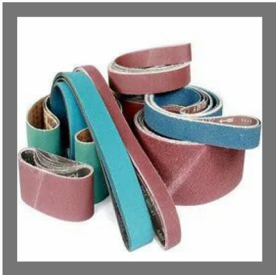
Emery Sanding Belts