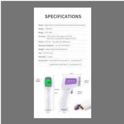
Non Contact Infrared Thermometer