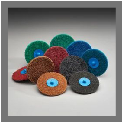
Non Woven Disc