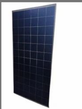
Polycrystalline Solar Module