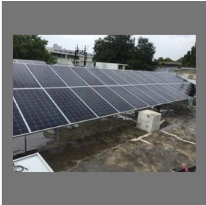
Roof Top Solar System Installation Service