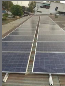
5 kW Off Grid Solar Roof Top Power System