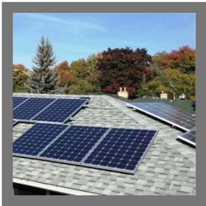
On Grid Solar Plant Installation Service