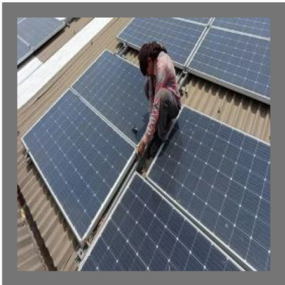
Off Grid Solar Plant Installation Service