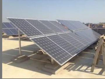
Off Grid Solar Rooftop System