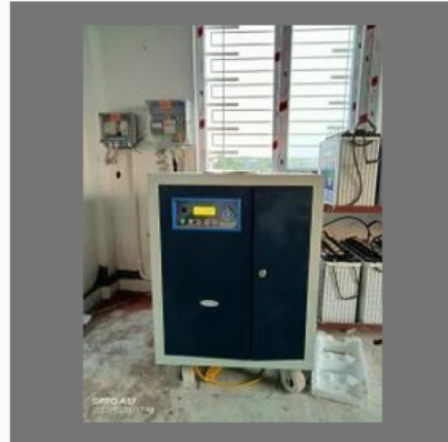
Off Grid Solar Inverter