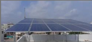
6 kW On Grid Solar Power System