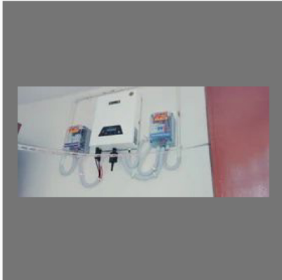
On Grid Solar Inverter