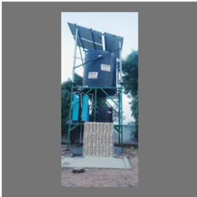
500 LPH Solar RO System