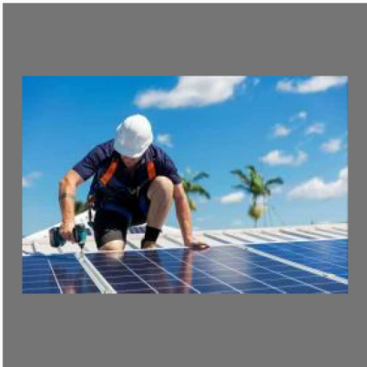
On Grid Solar Panel Installation Service