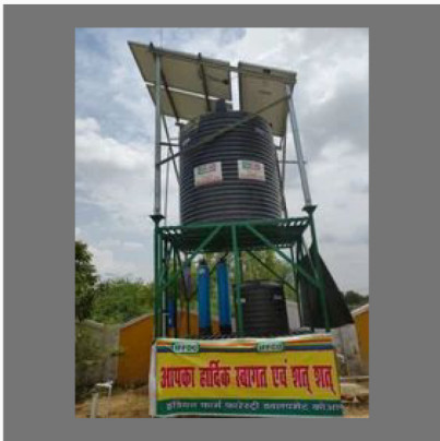
Solar Powered RO System