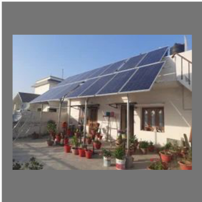
Rooftop Solar Photovoltaic System