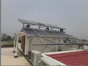
5 kW On Grid Solar Roof Top Power System