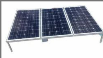
Monocrystalline Solar PV Panel