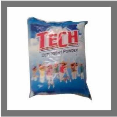
Tech Detergent Powder