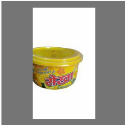
Dishwash Bar Tub