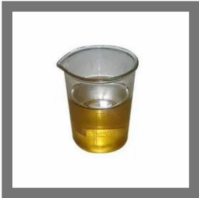
Acid Slurry (Labsa ) And All Detergent Chemicals And Raw Materials