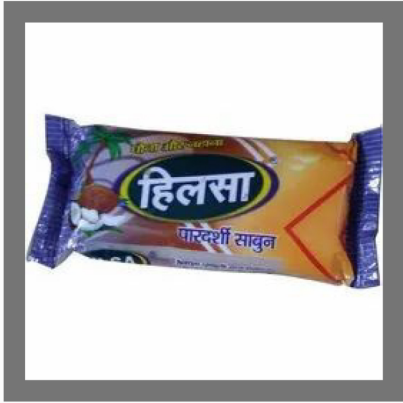
Solid Hilsa Laundry Washing Soap