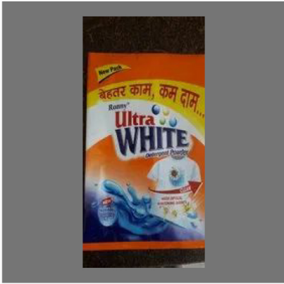
Ultra White Detergent Powder