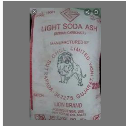
Soda Ash Powder