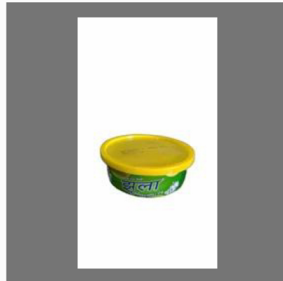
Dishwash Bar Tub