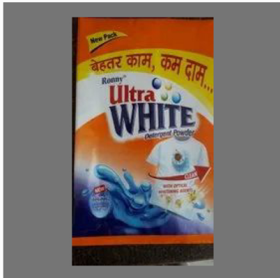
Ultra White Detergent Powder