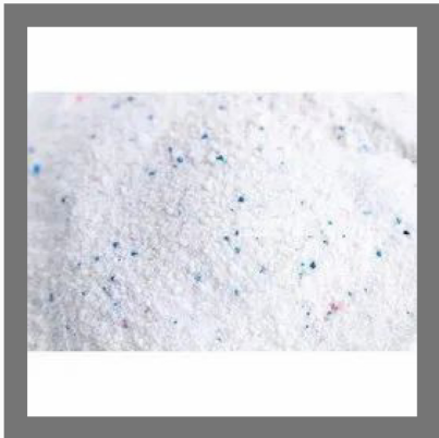
Loose Detergent Powder