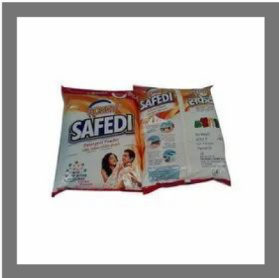
Ronny Safedi Detergent Powder